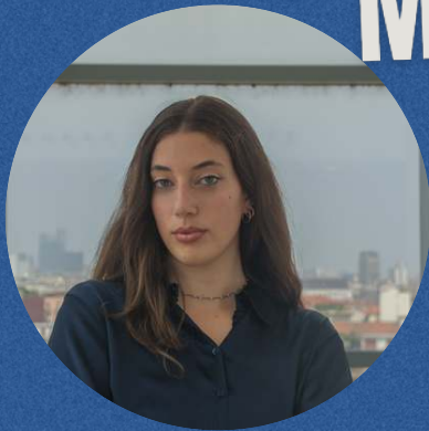
Francesca Trivellato @trivellato.francesca